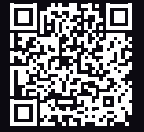
RUT951 360° VIEW

// RUT951 took the best features from one of the most popular Teltonika Networks cellular routers - RUT950.